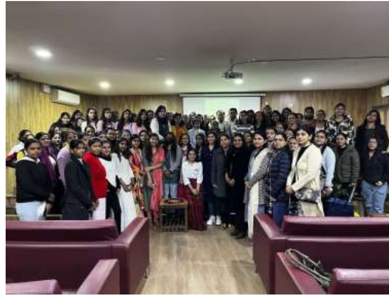
Talk on “Impact of White Collar Crime in Society; Its Forensic Examination & Scope”