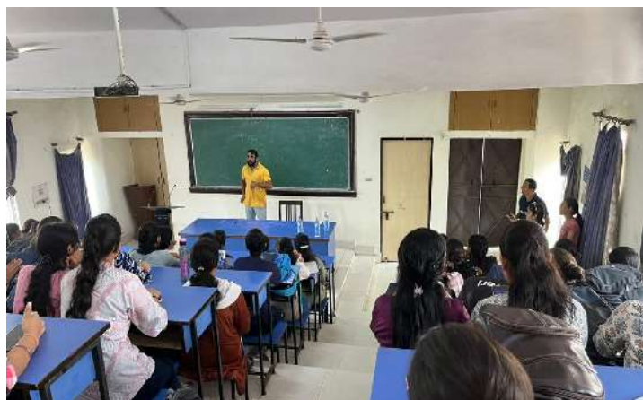
Career guidance programme by “CHEM ACADEMY”