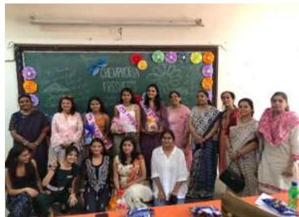
Fresher's party 2023