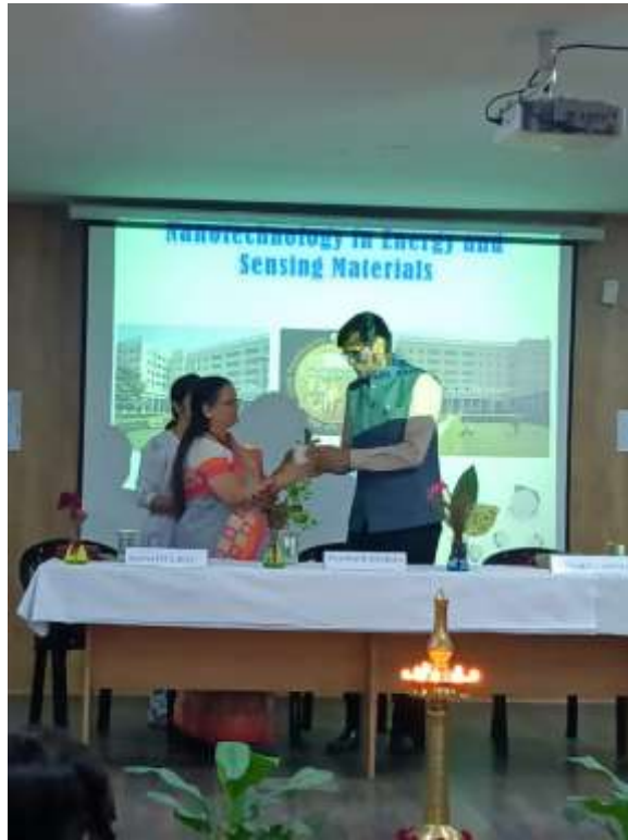
Lecture on “Nanotechnology in Energy and Sensing Applications”