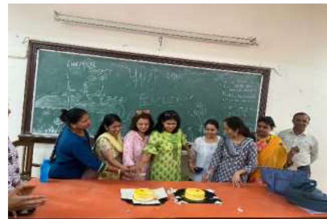
Teachers' day celebrations