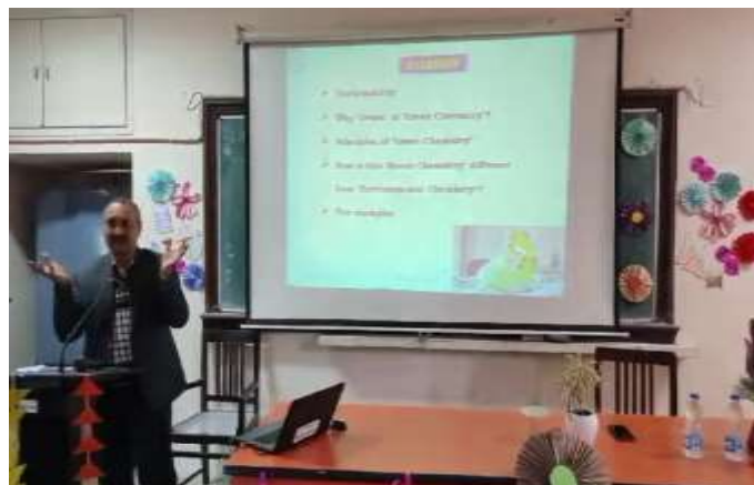
Lecture on “Green chemistry: path to a sustainable future”