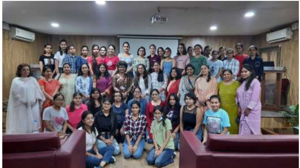
Lecture and interactive session on “Understanding Workplace Ergonomics to prevent Musculoskeletal Disorders”