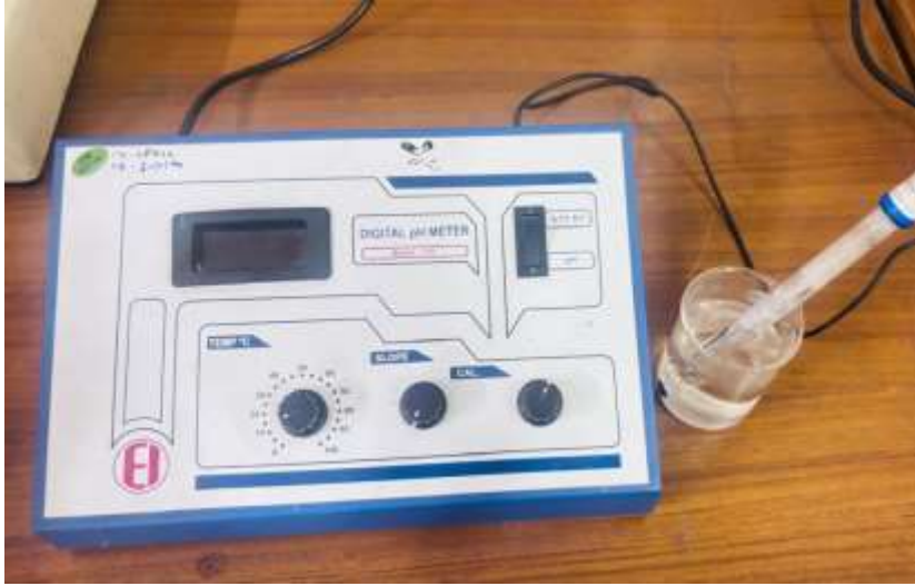
Digital pH meter