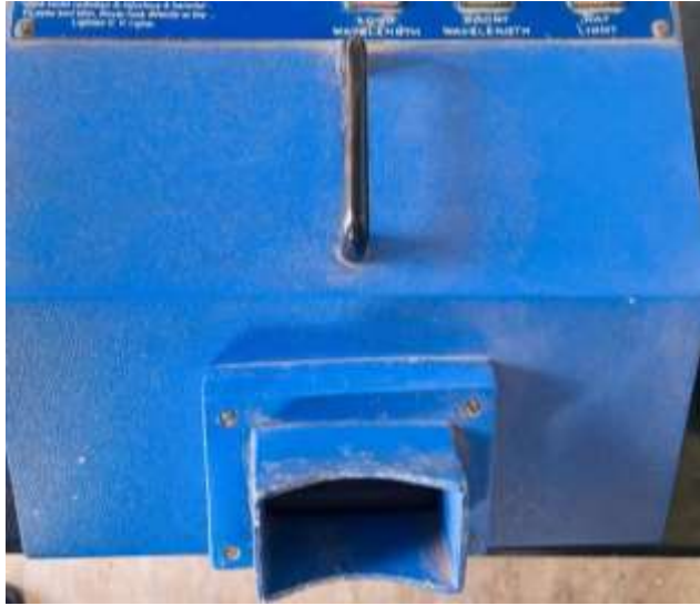
UV Fluorescence Analysis Cabinet