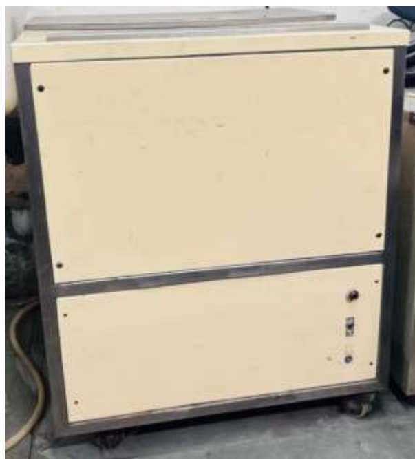
Ice Making Machine