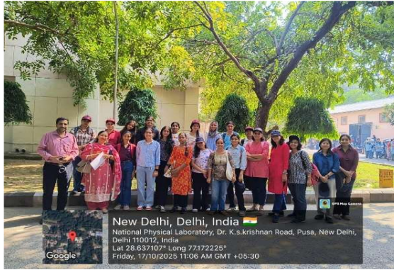
Educational visit to CSIR-National Physical Laboratory (NPL), Delhi