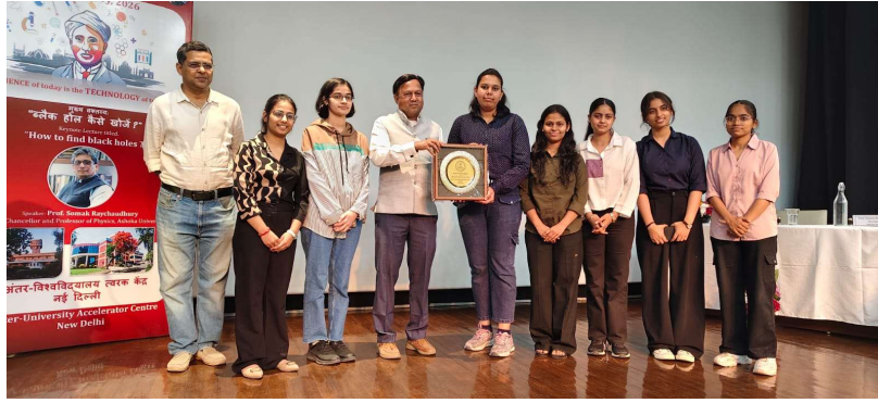
Poster Presentation at Inter University Accelerator Centre (IUAC), New Delhi