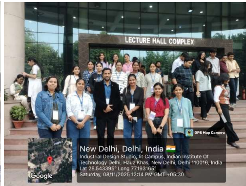
Visit to Indian Institute of Technology Delhi (IIT Delhi) - Open House 2025